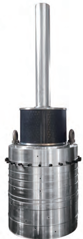
三層IBC模頭 3 Layer IBC Die Head