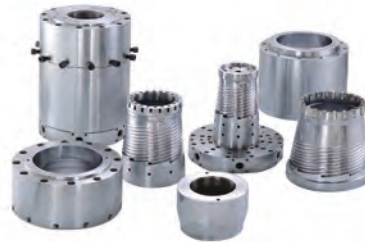
雙色及多色模頭 Two Color and Multi-Color Die Head