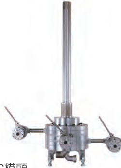
三層IBC模頭 3 Layer IBC Die Head