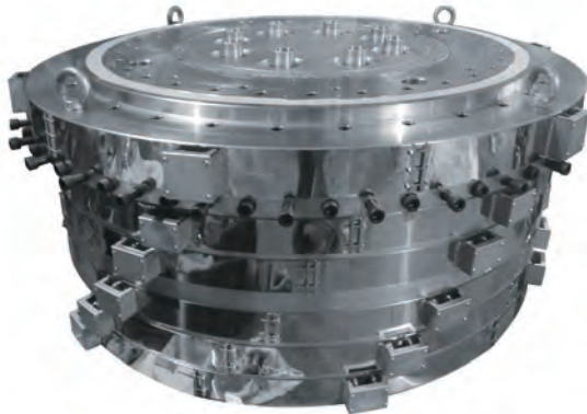
三層模頭1500mm 3 Layer Die Head 1500mm