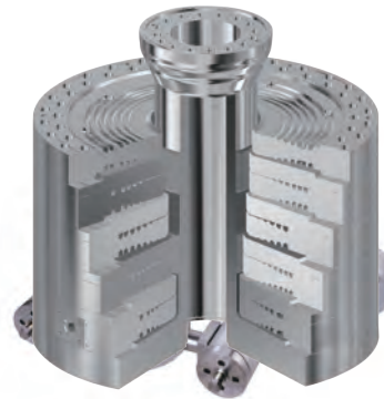
多層模頭 Multi-Layer Die Head