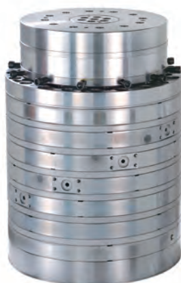
七層模頭 7 Layer Die Head