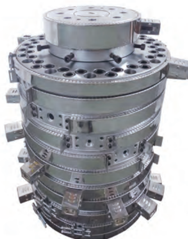
九層模頭 9 Layer Die Head